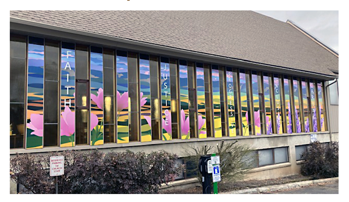
Art panels depict Palouse scenes and the faith values of Pullman UCC church.

Those include food and housing action through Community Action Center, meals for homebound seniors through Meals on Wheels, crisis housing support through the Community Relief Fund, housing homeless families through Family Promise of the Palouse, supporting the LGBTQ+ community through Inland Oasis, housing until recently Cooper's Legacy Thrift Shop, supporting statewide advocacy through Faith Action Network, maintaining equity through the Palouse Council on Racial Equity, empowering volunteers to send letters to encourage voters to vote through Vote Forward, promoting self-esteem through Pullman Child Welfare, FaVs news, and improving lives of people in Nicaragua through