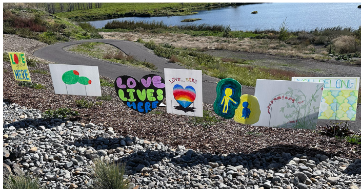
Community members create signs calling for spreading love.

While participating in the World Council of Churches in September 2022 in Germany,