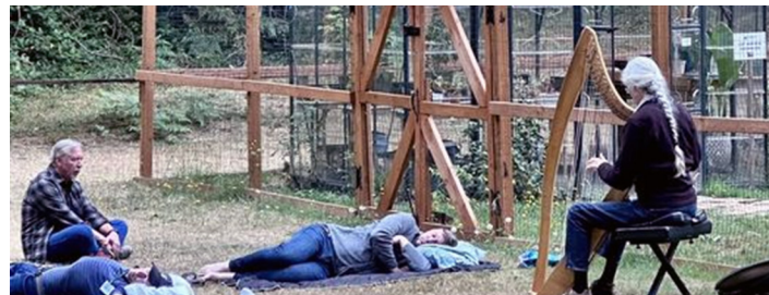
Pilgrim Firs work camp, rainbow over labyrinth and harp retreat.

Top photo courtesy of Pilgrim Firs. Bottom photo by Casey Lewis