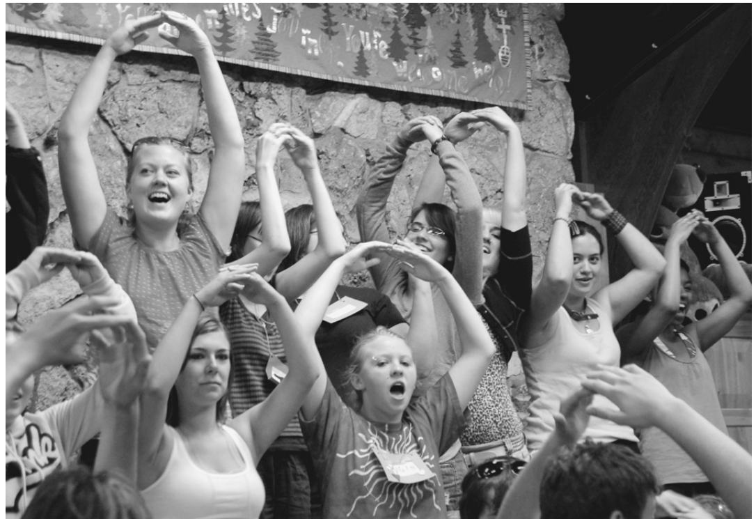
Senior high campers at Pilgrim Firs engage in song with motions.

"We created a Family Camp of about 35 folks—ages four to 90 years—who sang, studied, crafted, recreated, played, prayed and cared for one another in compassionate, faithful ways. We left grateful for this 'jewel' of an intergenerational camping experience that embraced families of