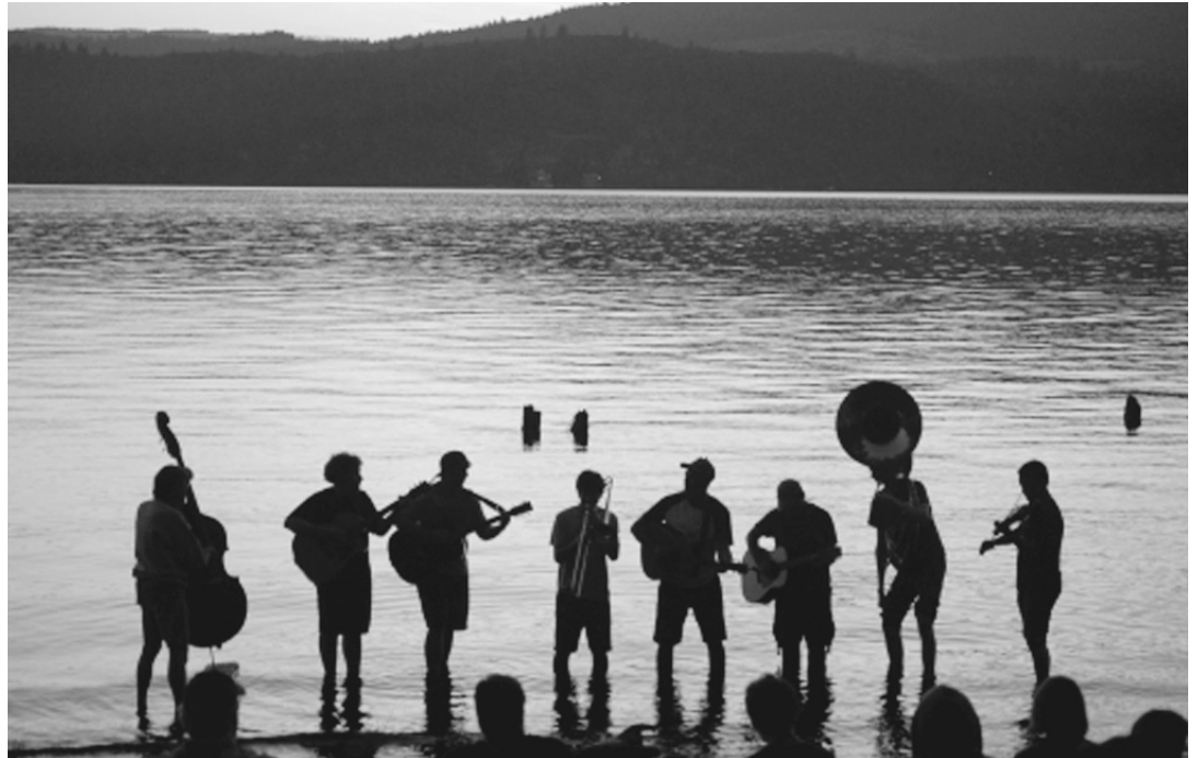
‘Raggedy Band’ provides water music from the shores of N-Sid-Sen on Lake Coeur d’Alene.