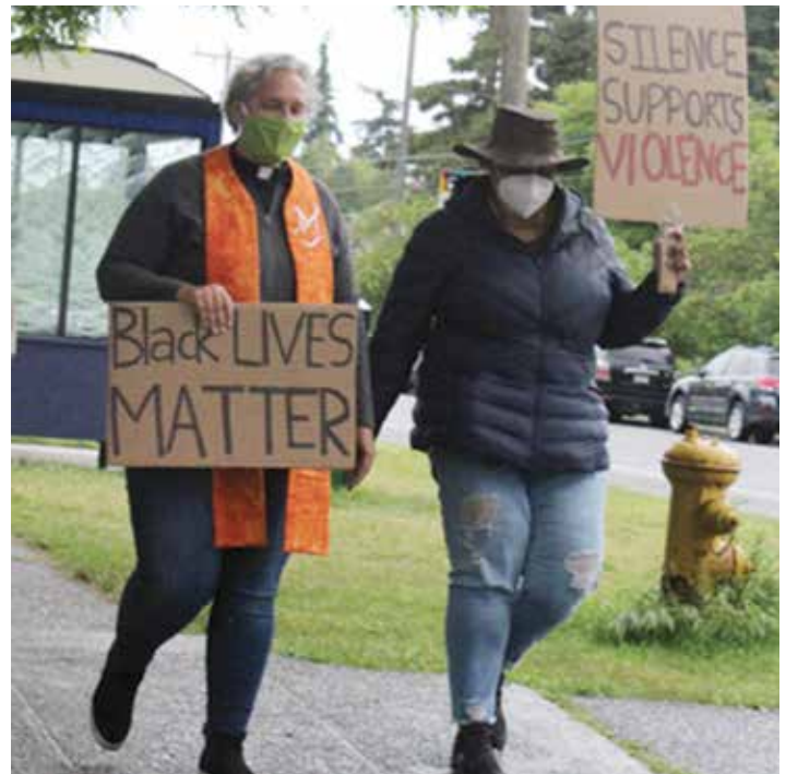
Members share concerns with the community.

• "They are following black public leaders on social media,