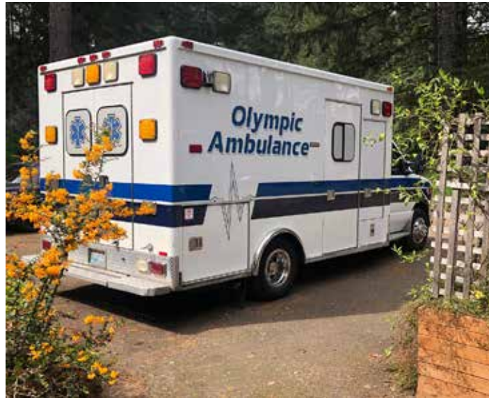
Pilgrim Firs sign announces guests in quarantine center.

A team of health, social services and emergency management personnel make the centers supportive, safe and secure. Medical support is available on site, but patients care for themselves. Necessities are provided, so patients don't need to leave the grounds. Anyone who does is not readmitted. Staff and security personnel are on site 24