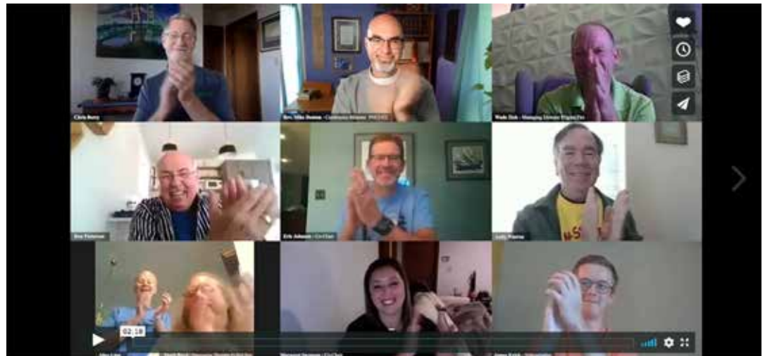
Camp Campaign organizers share their gratitude in a thank-you video

They collected numerous stories of how camp has changed many lives through the years and shared them in the campaign video that tells