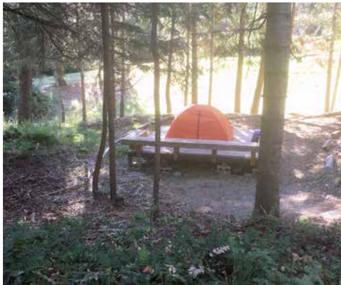
Tenter uses one of two new tent platforms at N-Sid-Sen, built with wood from Cabin 8, which was damaged by a fallen tree.