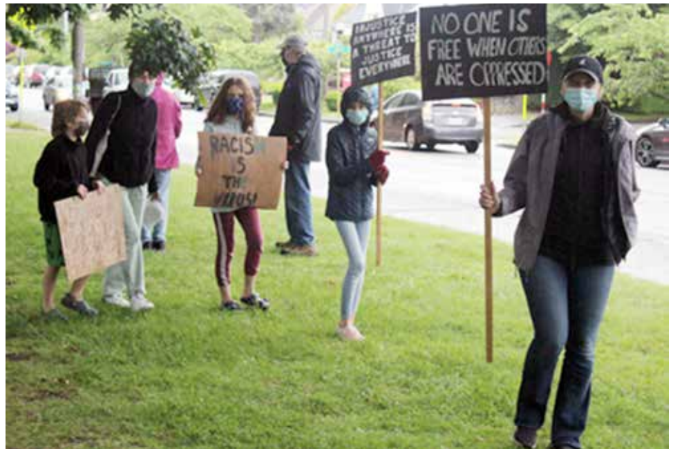
Magnolia UCC members join in community Black Lives Matter march in the summer.